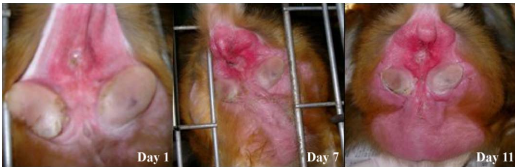
Fig. 2. Sex skin photos from one rhesus monkey in Group II. Day 1 shows the sex skin at the first rhFSH treatment, Day 7 shows the maximal increase of sex skin swelling, and Day 11 shows the maximal extent of the sex skin just before oocyte retrieval.

whereas the other two animals that were poor responders did not show any changes in these aspects. Moreover, according to the maximal changes of sex skin as above, prepubertal monkeys in Group IV received hCG on Days 7, 8, 9, and 11 of stimulation, and subsequently, the development potential of IVF oocytes