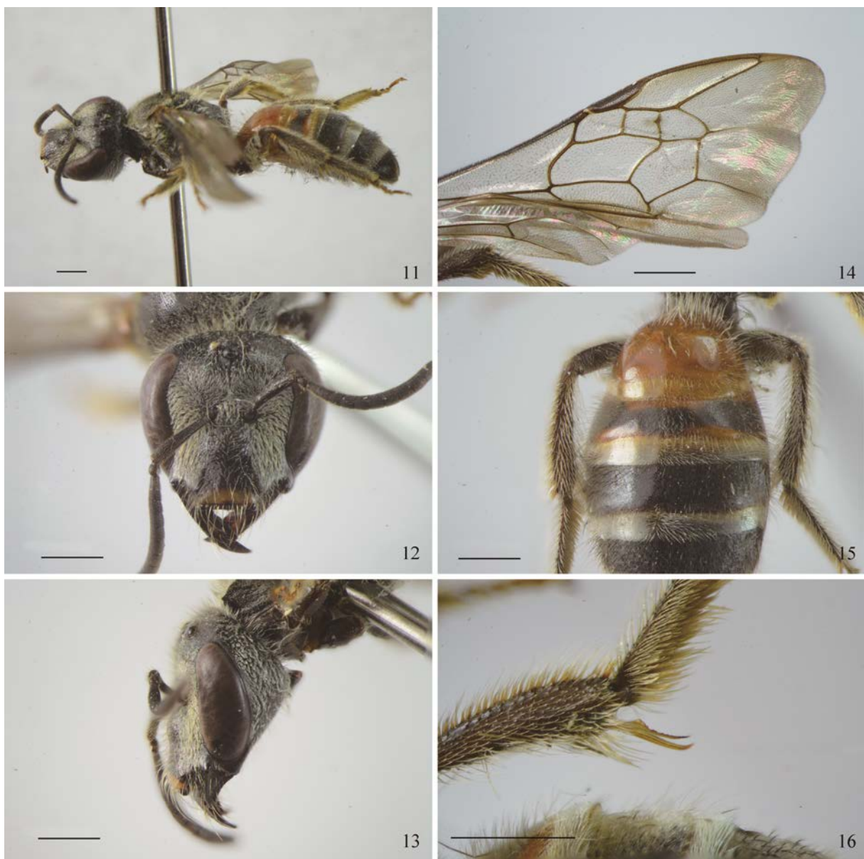
Figures 11–16. Thrinchostoma (T.) sladeni Cockerell, 1913, female. 11. Habitus, lateral view. 12. Head, frontal view. 13. Head, lateral view. 14. Fore wing, dorsal view, showing second submarginal crossvein angulated medially. 15. Metasoma, dorsal view, showing T1–2. 16. Hind tibia, showing the inner tibial spur. Scale bars = 1 mm.

Diagnosis. All specimens collected from China bear the following characters: the male malar area nearly as long as the width of mandible base (Fig. 3), metafemur, metatibia strongly swollen, and metatrochanter ventrally with angular projection (Fig. 6), basal margin of S5 with two transverse rows of spines numbered in 3 respectively at both sides (Fig. 5); the female malar area about one-third as long as the width of mandible base (Fig. 13), second marginal crossvein angulated medially (Fig. 14), metasomal terga with short, simple, laterally-directed hairs on posterior marginal zones, T2 with broad orange apical margin (Fig. 15). All these characters diagnosed our specimens as T. (T.) sladeni Cockerell, 1913.