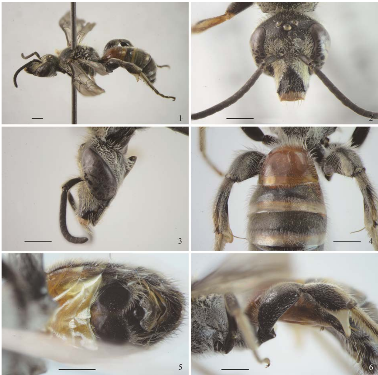
Figures 1–6. Thrinchostoma (T.) sladeni Cockerell, 1913, male. 1. Habitus, lateral view. 2. Head, frontal view. 3. Head, lateral view. 4. Metasoma, dorsal view, showing T1–2. 5. Metasoma, ventral view. 6. Hind leg, lateral view, showing the trochanter, femur and tibia. Scale bars= 1 mm.

examination of specimens collected from the Naban River Watershed National Nature Reserve (NWNR), located in Xishuangbanna of Yunnan Province, we found two species of Thrinchostoma (T.) for the first time in China. In this paper, a key to the two known Chinese species of Thrinchostoma (T.) is presented.