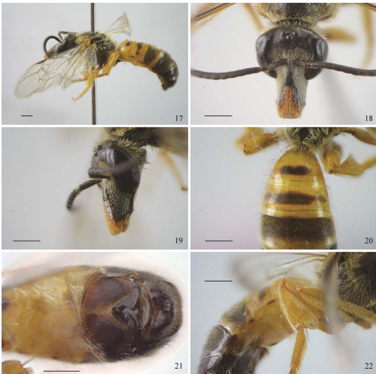
Figures 17–22. Thrinchostoma (T.) yunnanense Niu & Zhu, sp. nov. , male. 17. Habitus, lateral view. 18. Head, frontal view. 19. Head, lateral view. 20. Metasoma, dorsal view, showing T1–2. 21. Metasoma, ventral view. 22. Hind leg, lateral view, showing the trochanter, femur and tibia. Scale bars = 1 mm.

Distribution. China (Yunnan), India (Assam, Khasia Hills; Cockerell, 1913).