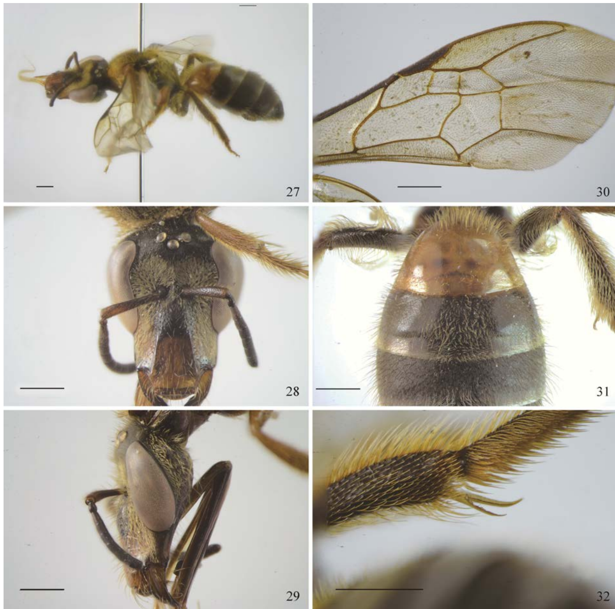
Figures 27–32. Thrinchostoma (T.) yunnanense Niu & Zhu, sp. nov. , female. 27. Habitus, lateral view. 28. Head, frontal view. 29. Head, lateral view. 30. Fore wing, dorsal view, showing second submarginal crossvein straight medially. 31. Metasoma, dorsal view, showing T1–2. 32. Hind tibia, showing the inner tibial spur. Scale bars = 1 mm.

blackish-brow band (Fig. 20); S1–3 pale yellowish-brown, S5 blackish-brown, S6 black (Fig. 21); legs yellowish-brown, except coxae, out-surface of fore trochanteres and basal out-surface of fore femur (Figs 17, 20, 22). Vertex, low part of frontal area, malar area and genal area covered with short yellowish-white plumose pilosity (Figs 18–19); parts of mesosoma also covered with pale yellowish-white plumose hairs in different length.