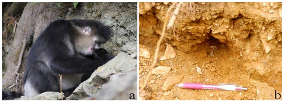
Figure 2. a) An adult male is eating soil; b) A geophagy site in mixed coniferous and deciduous broadleaf forest.